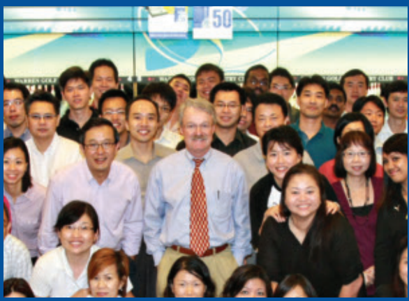
Employees celebrate Teradyne's 50th anniversary with a bowling party in Singapore

years ago. The Magnum and UltraFLEX-M products are well positioned in both the flash memory and DRAM sectors, so there is good runway ahead as the memory market continues its comeback.